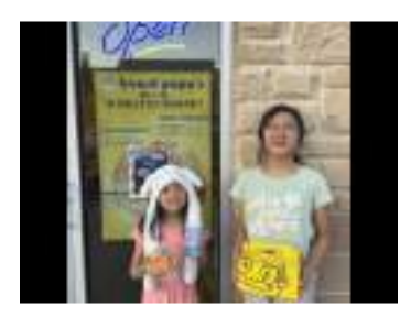
Thank you, Beard Papa's!